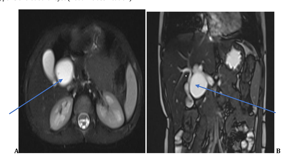
Type IC choledochal cyst (Todani classification).

(A) T2 axial & (B) T2 trufi shows fusiform dilatation of proximal & mid CBD (C) USG image shows dilated CBD. suggestive of